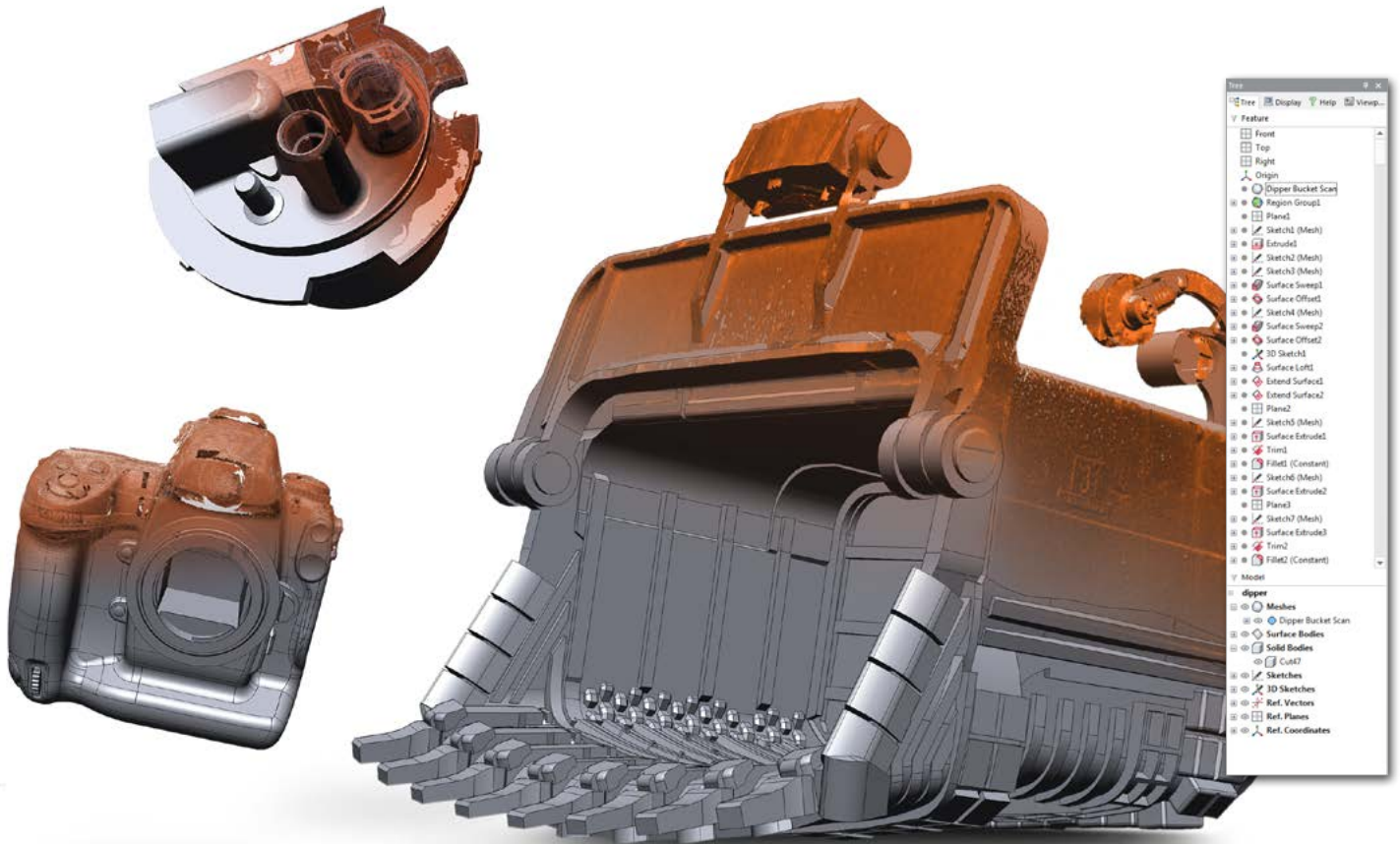
A parametric solid models created in Geomagic Design X

Save significant money and time when modeling as-built and as designed parts. Deform an existing CAD model to fit your 3d Scans. Reduce tool iteration costs by using actual part geometry to correct your CAD and elimination part springback problems. Reduce costly errors related to poor fit with other components.